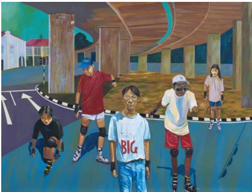
Urban Playground 1994, acrylic on canvas, 139 × 185 cm Collection of artist's family.