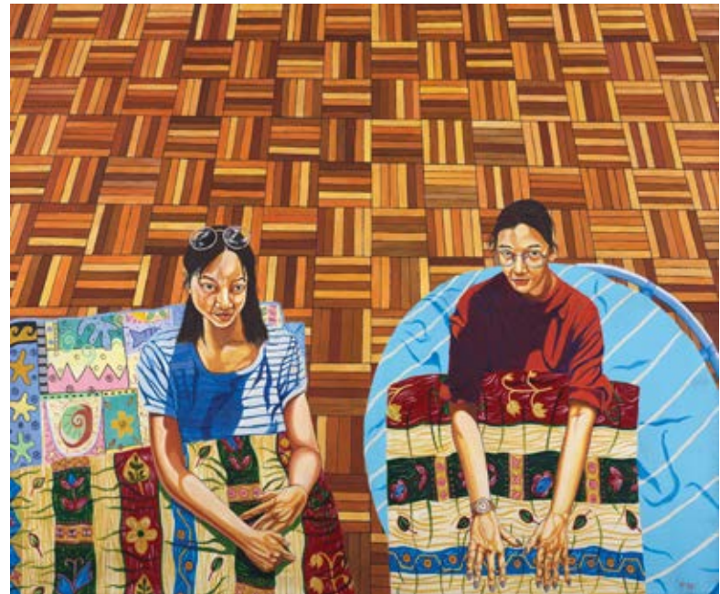
Untitled (Two Friends) 1998, acrylic on canvas, 127 × 152 cm Collection of Charles Lok