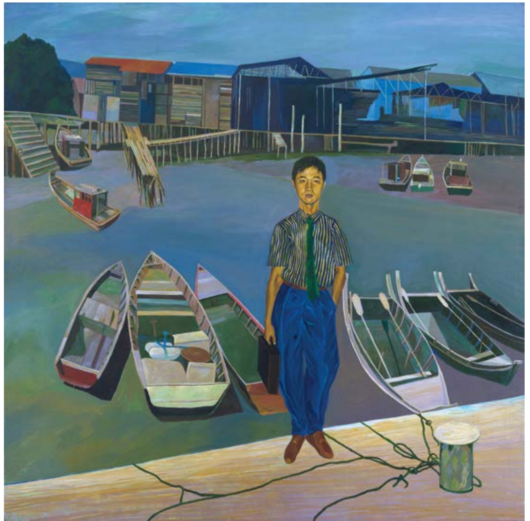
Portrait of an Insurance Salesman in Pulau Ketam 1993, acrylic on canvas, 164 × 162.5 cm Collection of Khazanah Nasional Berhad