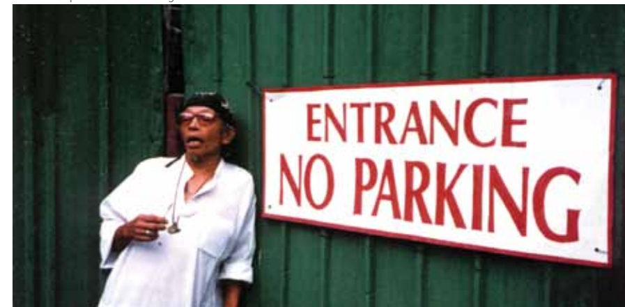
Screen capture from The Big Durian

Kami menyediakan lawatan berpandu berunsur interaktif ke pameran kami untuk kumpulan pelajar sekolah. Ini bertujuan untuk mengasah daya pengamatan dan mengembangkan pemikiran kritis pelajar. Sila e-mel info@ilhamgallery.com untuk temujanji. Perlu diingatkan sebarang temujanji memerlukan notis awal 7-10 hari sebelumnya.